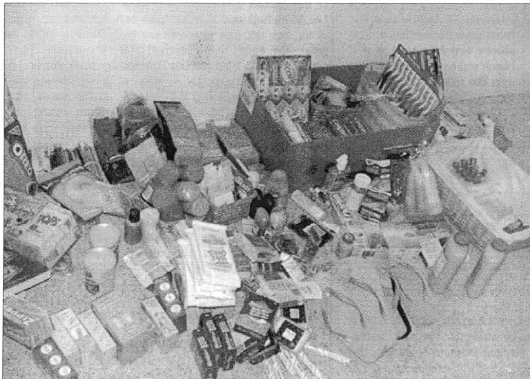
PACKAGES FOR U.S. troops serving overseas can include everything from flip-flops, toothpaste, mini boxes of cereals, deodorant, moist towelettes and cans of beans, to name just some items.